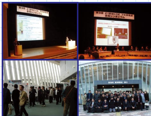
At the symposium

The 3rd 21st Century COE Seven Universities Joint Symposium was held on March 8 (Thurs), 2007 at the Hiroshima University Higashi Hiroshima Campus and Hiroshima University Satake Memorial Hall. With the purpose of promoting research exchange between universities and the communication to society of the research activities of each program, young researchers from the COE programs in seven universities including this program take the lead in planning and operating this symposium. Continuing from the previous symposium held at Nagoya University 2005, this symposium was headed by Hiroshima University. At the symposium, introduction to activity content at each office, guest lectures, poster presentations, and panel discussions were