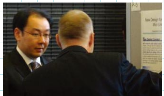
Discussion at a poster session

An international symposium on mechanical systems innovation entitled “The 3rd International Symposium on Innovative Aerial/Space Flyer Systems -Mastering Flight-” was held on November 24 (Fri) and 25 (Sat), 2006 at Takeda Hall in the Takeda Frontier Science Building on Asano Campus. This symposium featured two sessions in each of the following areas, with the goal of making innovative aerial systems possible: (1) MAV (Micro Aerial Vehicle) and UAV (Unmanned Aerial Vehicle) research and development, (2) space energy usage, and (3) basic research. It was developed centering around researchers and students participating in the COE Program innovative aerial robot project, the space energy sub-project of the energy innovation project, and in basic research. Research findings from the COE Program from both fields were presented. H. Jin Kim (Seoul National University, Korea), Cees Bil (RMIT University, Australia), Eric N. Johnson (Georgia Institute of Technology, U.S.A.), Agnès Luc Bouhali (ONERA, France), Sang H. Choi (NASA Langley Research Center, U.S.A.), Yves Ribaud (ONERA, France), and Norbert Mueller (Michigan State University, USA) were invited to give lectures about state of the art research results. Furthermore, the 27 poster lectures and discussions as well as demonstration experiments given by students were lively thanks to active participation of the guests.